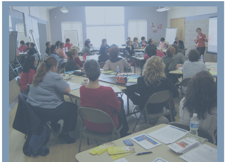
Kitchener-Waterloo Community Dialogue – November 27 th , 2007