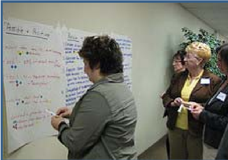
Deciding on "Positive and Possible Actions" to build the capacity of our organizations (Halton Community Dialogue – Nov. 13, 2007)